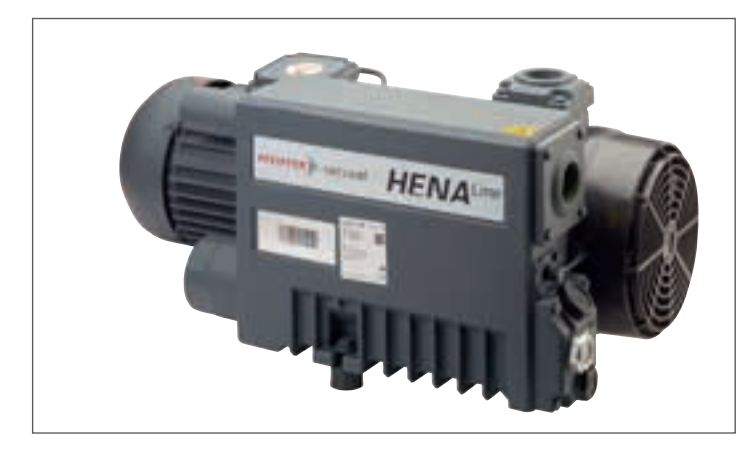
HenaLine – single-stage rotary vane pumps

The UnoLine Plus can be optimally employed for industrial applications. This rotary vane pump has proven itself for years as a backing pump for Roots pumps. This pump is water cooled and extremely insensitive to dust and dirt. It is equipped with an oil regeneration system. Condensates, contaminants and dust particles can be separated from the operating fluid, collected in the vapor separator and drained. The adjustable cooling water controller enables the UnoLine Plus pump to maintain the required operating temperature. These pumps are equipped with gas ballast in order to pump down vapors.