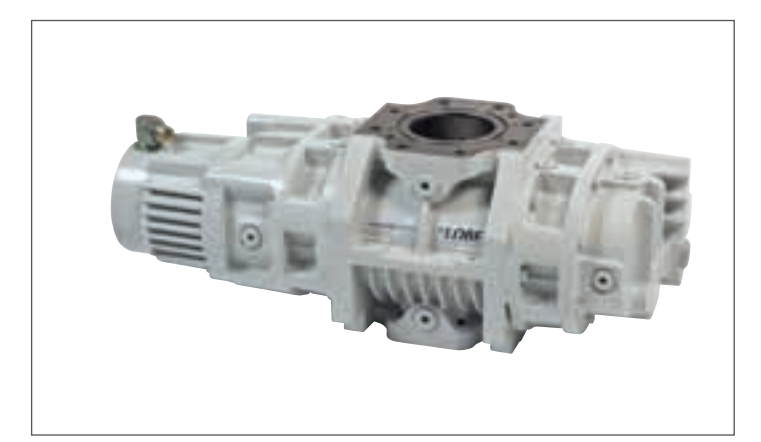
HiLobe 1302 - the compact powerhouse

With its powerful drive, the HiLobe can reach a very high differential pressure for a short time. This makes it particularly suitable for load lock applications, such as in PVD coating systems and leak detection. These are processes that require extremely short cycle times.