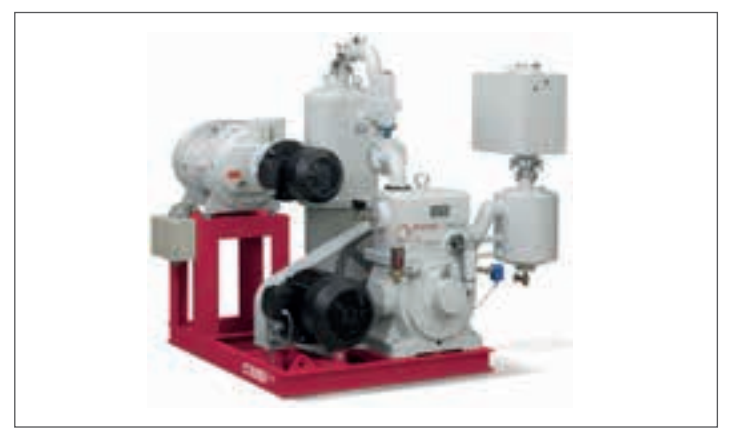
UnoLine Plus – especially for industrial applications