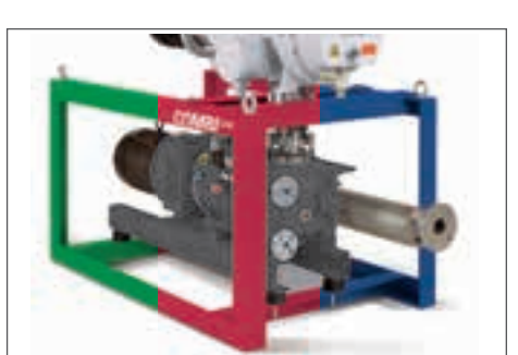
Different color variants