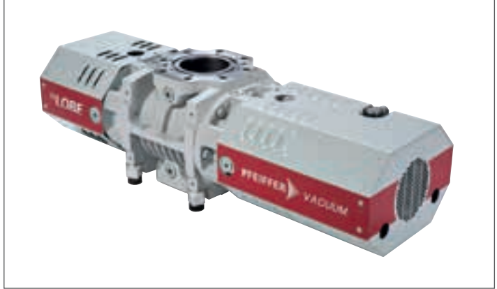
HiLobe 2104 - the compact powerhouse