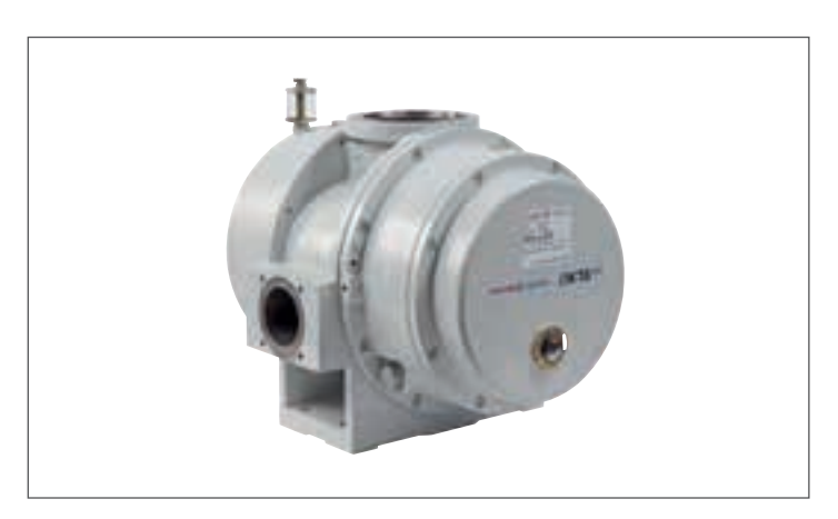
OktaLine G – for high differential pressures

OktaLine G gas circulation-cooled Roots pumps offer additional flexibility. These pumps are ideal for compressing against atmospheric pressure in applications with high pressure differences and maximum gas throughput. Thanks to their special cooling system, these Roots pumps can also be operated without a backing pump.