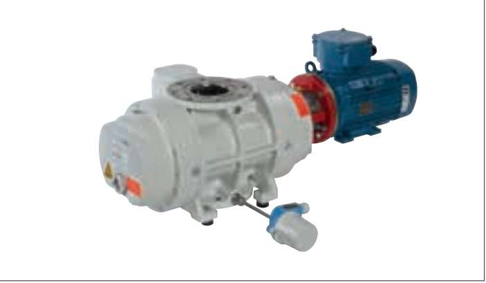
OktaLine - the proven allrounder