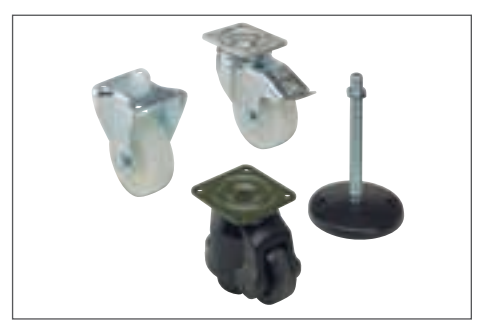
Swivel casters/machine feet