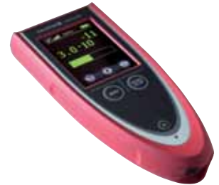
Remote control RC 500 WL

The ASM 380 can likewise be operated with the wireless remote control RC 500 WL. This enables the leak detector to be operated even from a distance of up to 100 meters.