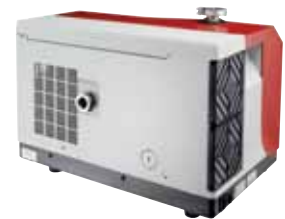
ASM 340 I