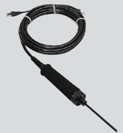
Sniffer probe LP 505