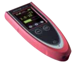
Remote control RC 500 WL

As an extension range, the ASM 340 exists also without a backing pump. This ASM 340 I allows to connect a different backing pump, for even more convenience and/or better adaptation to customer application, as for example in case of integration into a leak detection system. The connection for the external backing pump is located at the rear of the leak detector”.